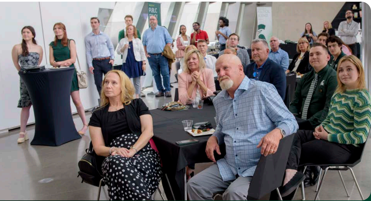
Family and friends celebrate the successes of the Political Science Scholars at their spring reception.